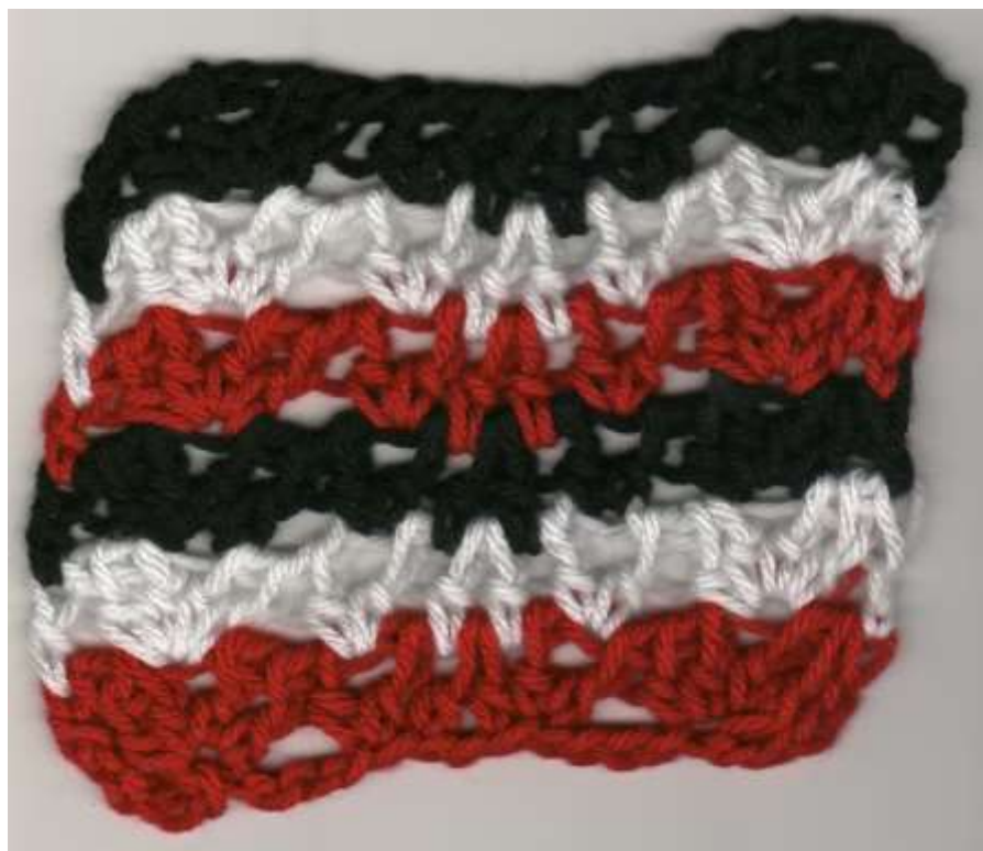
Figure 2 Tunisian crochet vintage wobble