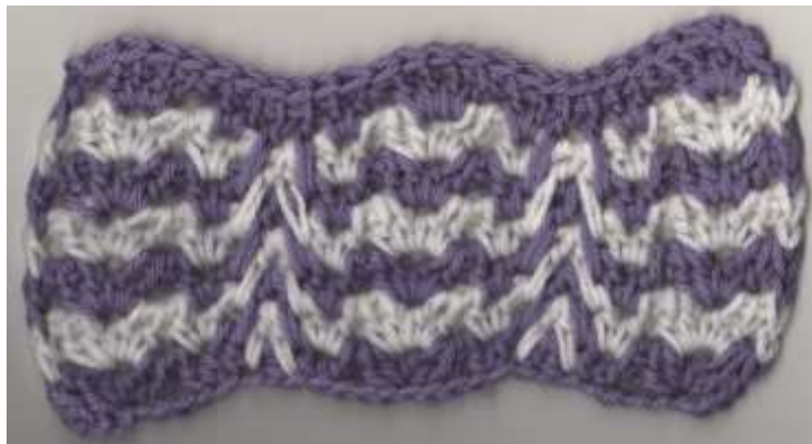
Figure 3 Front view