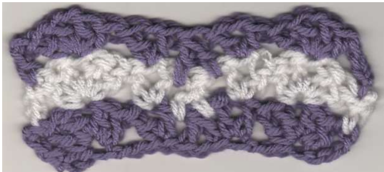
Figure 1 Regular crochet vintage wobble

Sample first done in regular crochet (Figure 1), then in Tunisian crochet (Figure 2).