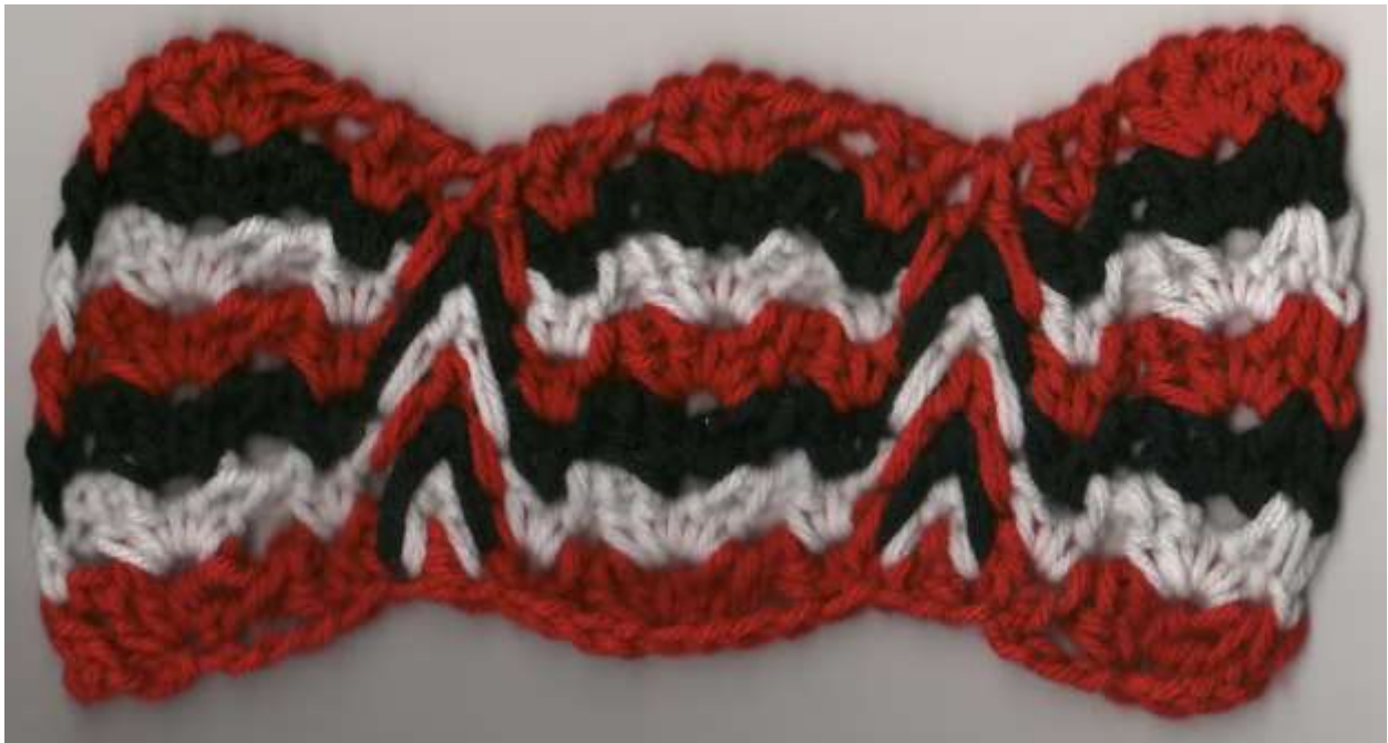
Figure 5 Front, three colours