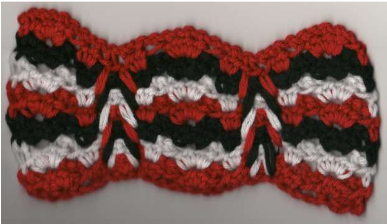
Figure 6 Back, three colours

Dela Wilkins: Lifecare on Ravelry Railwayknitting.com